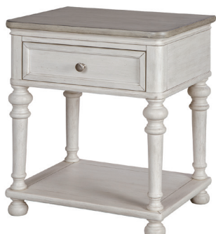
160-355 Leg Nightstand (Antique Weathered White & Gray) 20W x 18D x 28H