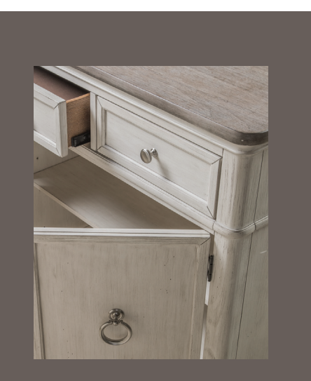
Ample storage behind doors and in drawers is provided in the Credenza Sideboard.