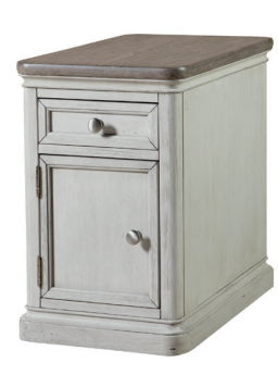
160-827 Chairside Table (Antique Weathered White & Gray) 15W × 26D × 23.25H

160-260/-261/-25R King Uph Headboard and King Uph Footboard Bed King Bed Rails 6/6 (shown right) (Antique Weathered White & Gray) Overall: 80.875W x 89D x 69H 160-260 King Uph Headboard 6/6 80.75W x 3.375D x 69H 160-261 King Uph Footboard 6/6 80.875W x 4D x 24H 160-25R Bed Rails (5/0 & 6/6) 82W x 2.125D x 8H Also available as King Headboard only.