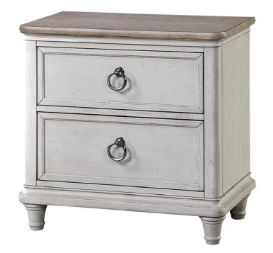
160-350 Drawer Nightstand (Antique Weathered White & Gray) 29.25W x 17.75D x 28.75H

160-04M Landscape Mirror (Antique Weathered White) 44W x 2D x 39.5H