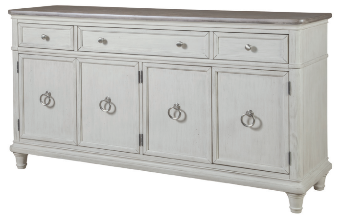
160-679 Credenza Sideboard (Antique Weathered White & Gray) 66.125W x 19D x 36H