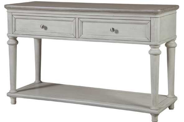
160-803 Sofa Table (Antique Weathered White & Gray) 48W x 18D x 29.5H

160-801 Cocktail Table (Antique Weathered White & Gray) 48W × 28D × 18H