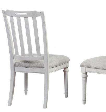
160-6325 Slat Back Side Chair (Antique Weathered White & Gray) 21.375W x 26D x 39.25H