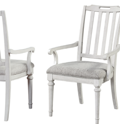
160-633A Slat Back Arm Chair (Antique Weathered White & Gray) 23.625W x 26D x 39.25H

160-654T/160-654B Trestle Dining Table Top and Base<br/>(Antique Weathered White & Gray)<br/>Overall: 76-94W x 44D x 30H-654T76-94W x 44D x 5.625H, with one 18" Leaf extends to 94W<br/>-654B-654B51.25W x 26.75D x 25H